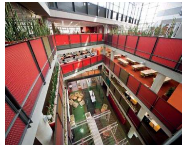
UFAD allows for good air change effectiveness